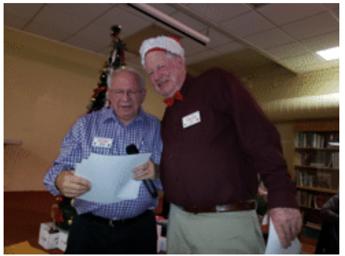
Continued on page 10...