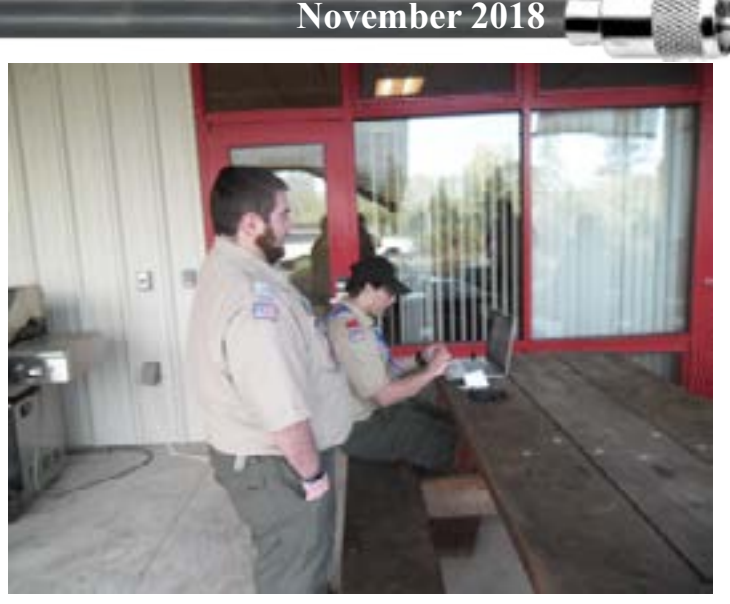
Scouts from Venture Crew 27 man the laptops ready for JOTI participants to arrive.