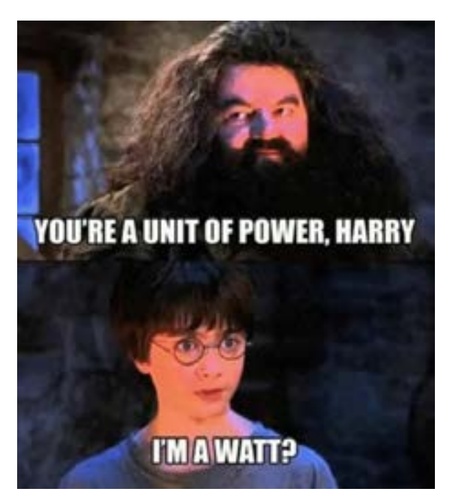
Visit Amateur Radio Funnies

Sat 10/6 Levi's GranFondo Bicycle Sat 10/20 JOTA (Jamboree On The Air) On the Air Sat 10/27 Bay Area Science Festival Outreach Sat 11/17 VE Testing Education