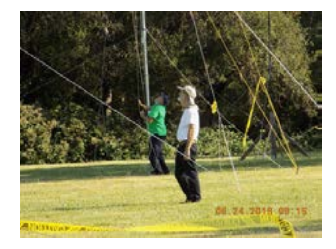
Continued on page 14...