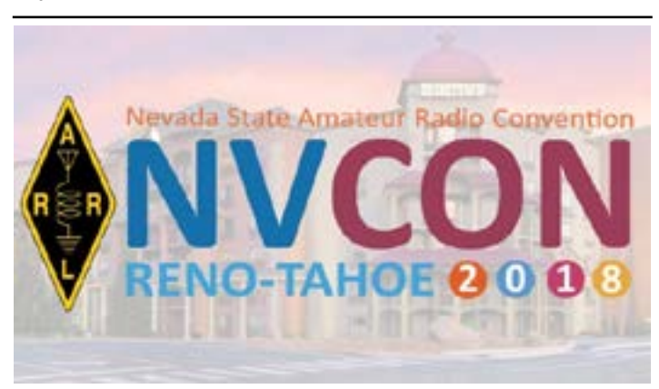
July 20 - 22, 2018 Nevada State Convention in Reno, NV

NVCON 2018 Returns to Reno, Nevada at Boomtown Casino Hotel July 20 through 22, 2018.