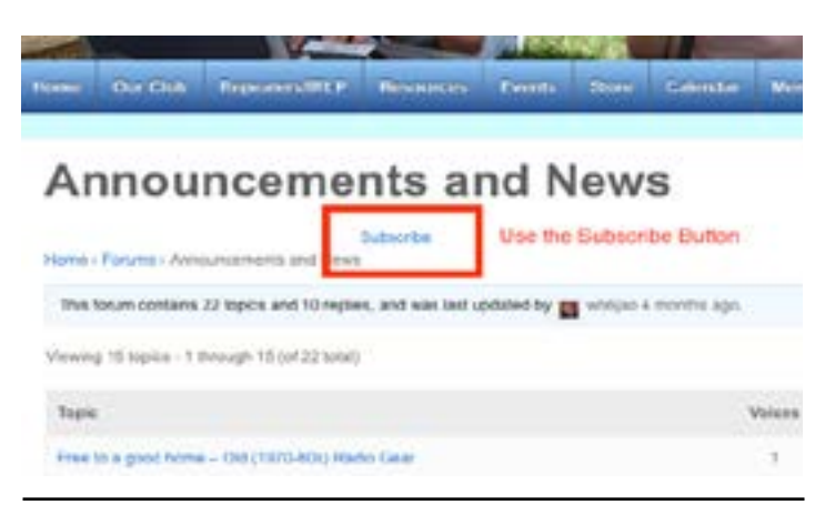
How to Subscribe to the SCRA Calendar

Don't worry about your inbox getting flooded with junk emails. Only valid members can post to the site.