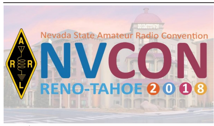
July 20 - 22, 2018 Nevada State Convention in Reno, NV

NVCON 2018 Returns to Reno, Nevada at Boomtown Casino Hotel July 20 through 22, 2018.