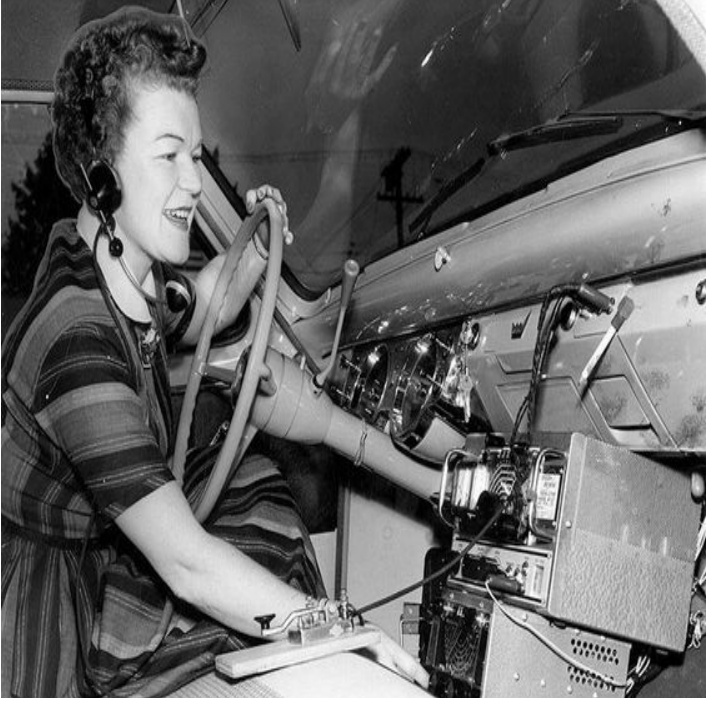
Not hands free? Just pull over and tap out the CW.

Send it to SCRA, Box 116, Santa Rosa, CA 95404 or bring money and completed renewal form to the January meeting.