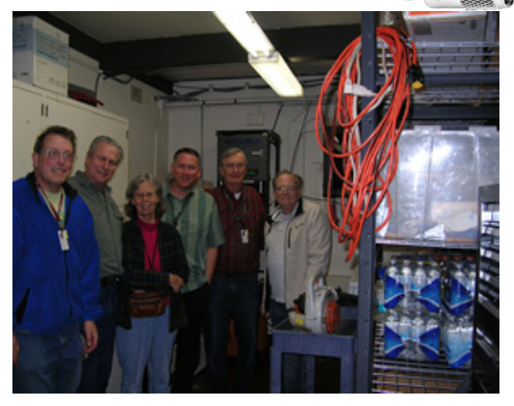
Santa Rosa AECS testing the radio at Fire Station 4 on February 2, 2015.