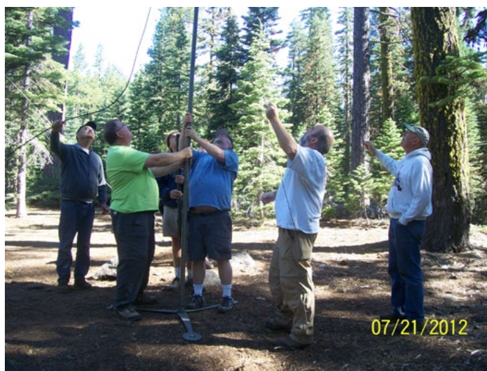
Rotating the 2m beam