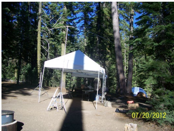
The camp site