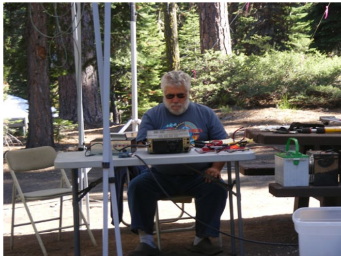
KI6MSP looking for a contact