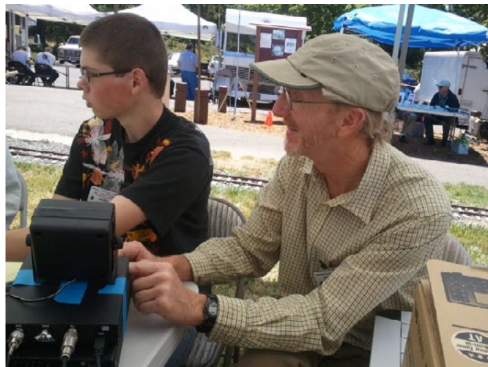
KJ6QIr and NQ6E working a station on Field Day