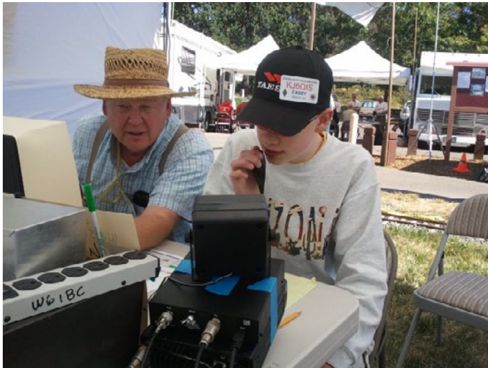
W6IBC and KJ6QIS working a station on Field Day