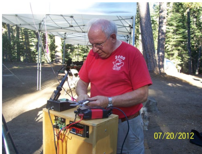
KE5RI fixing KI6MSP's coax