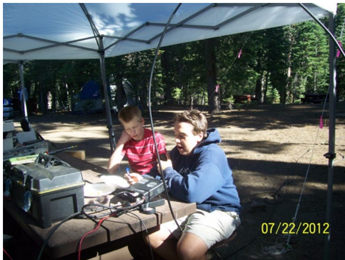
KJ6QIS and KI6ZON working HF