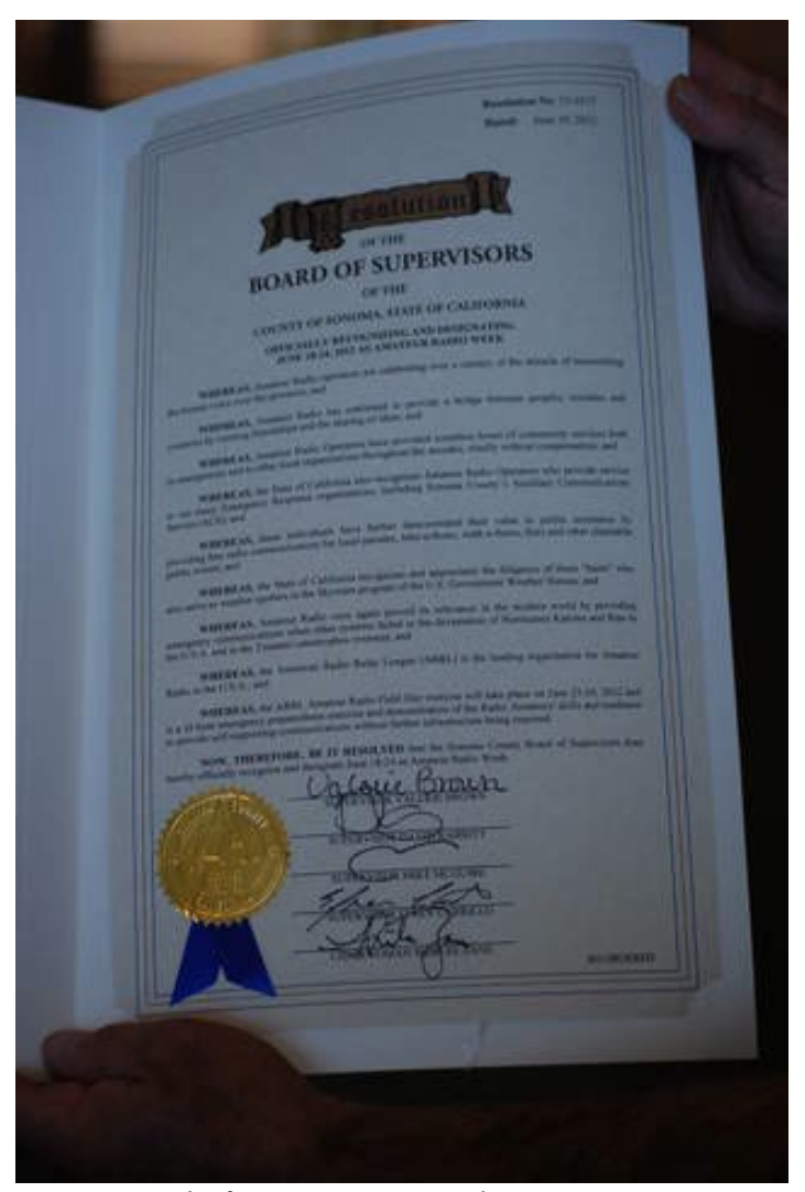
Board of Supervisors Resolution