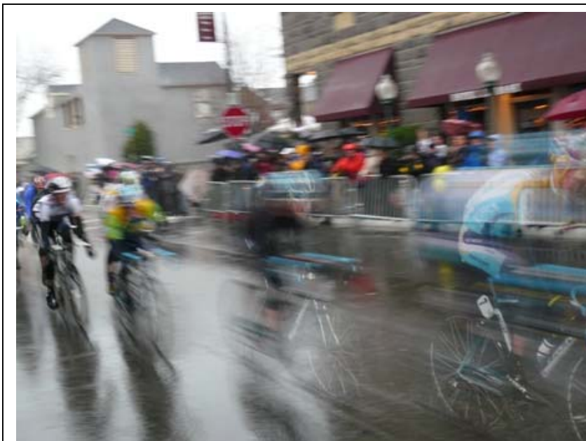
The blurr shown above is the Amgen Tour of California Peloton as it crossed through Railroad Square in Santa Rosa during the final laps to the Finish Line.

The women completed their race, we called in a few medicals for the paramedic crews and the rain let up. About an hour later everyone started to make their way to their posts as we prepared for the tour to enter the city. Still we couldn't get much out of the tour communications or the web site. Finally around 3:30 there was brief video shot somewhere on Silverado Trail and just as quickly it was gone. Fortunately I placed KG6BHI in Calistoga and got an early report on when they arrived there. Next thing you know we got a report from KE5RI that the CHP had come through and then the breakaway rider. And of course the rain really seemed to start coming down again. The rest of the pack arrived and before long they were in the downtown circuit. Portions of the peloton were held at Brookwood and 4th creating complete chaos. The rest of the guys raced their 3 laps and Francesco Mancebo won the stage. Meanwhile our hams were out there in the rain just like the