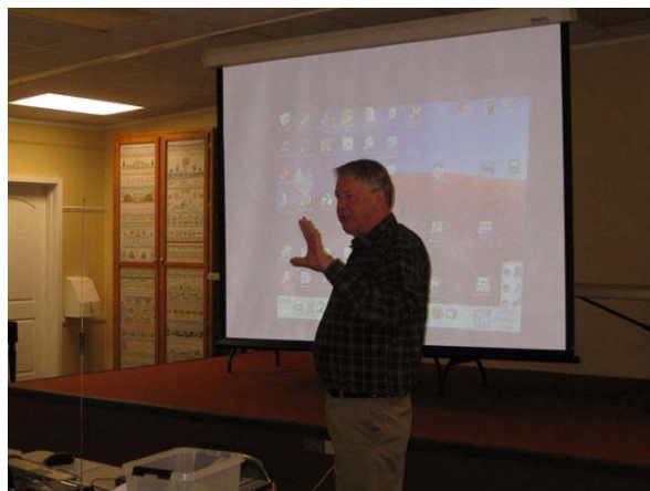
APRS Program by KG6JSL at January's meeting.