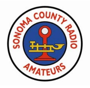
CLUB STATION W6LFJ