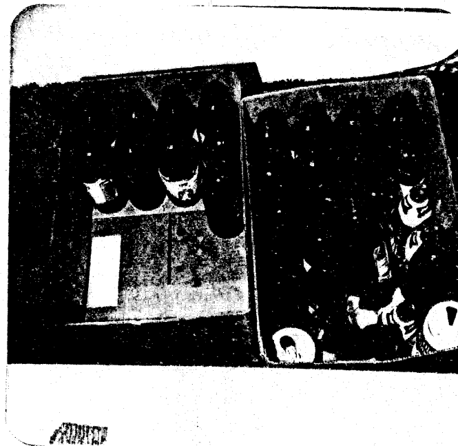
For those who doubted our bathtub story