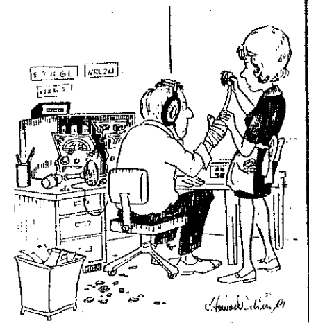
"I wish you'd learn to control your temper, Ralph. Remember, you were a CBer, too!"

Your ad could have been here! XXXXXXXXXXXXXXXXXXXXXXXXXXXXXXXXXXXXXXXXXXXXXXXXXXXXXXXXXXXXXXXXXXXXXXXXXXXX